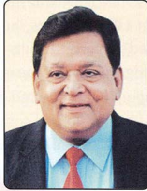
Shri A M Naik Chairman and Managing Director Larsen & Toubro Limited

Shri A M Naik, Chairman and Managing Director (CMD) of India's largest engineering and construction conglomerate Larsen & Toubro (L&T), joined the Company as a Junior Engineer in 1965. He was given the positions of increasing responsibility as he moved from General Manager to Managing Director and CEO, culminating in the appointment as Chairman of the year 2003. He has successfully led the Company through some of its most challenging times and enabled it to emerge stronger. His broad global perspective has seen the Company expanding its horizons beyond the domestic frontiers and positioning itself to become a true international player. His emphasis on HR and IT as the twin engines of growth has yielded significant results.